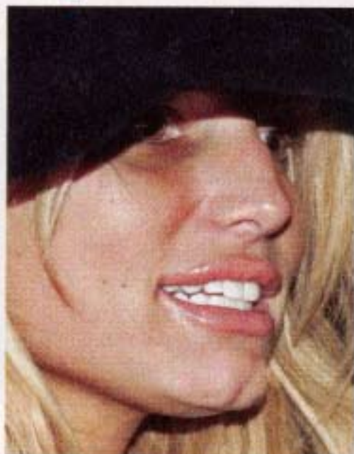
Black-and-blue or just tired in L.A. on January 11?