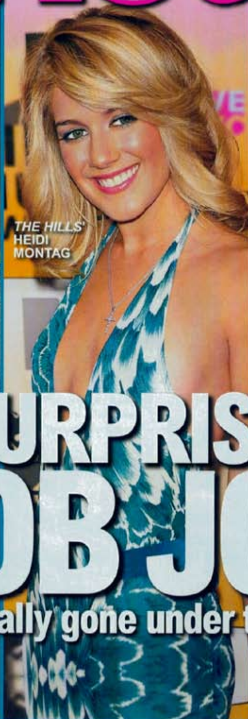
THE HILLS' HEIDI MONTAG