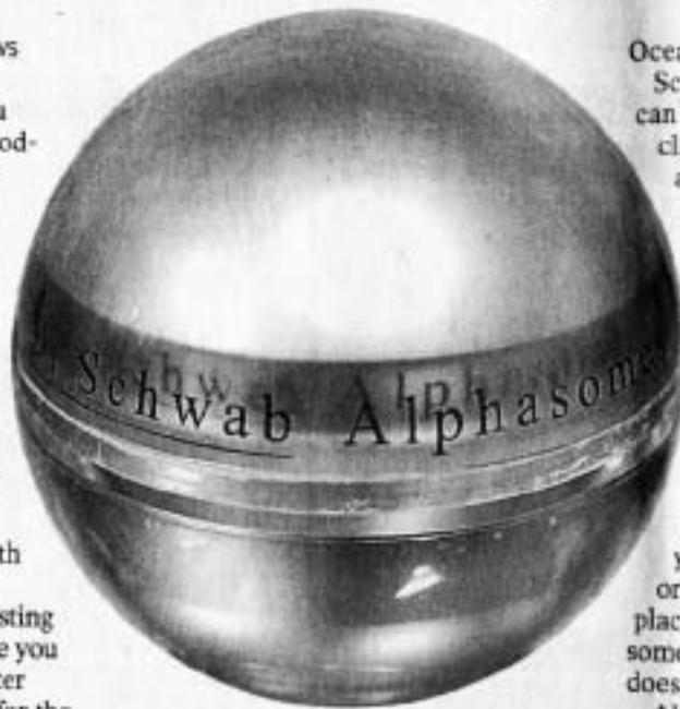
Alphasomes, which is manufactured in San Diego by CA Botana, sells for $500 a jar.

Alphasomes is a vegetable-derived treatment sold at high-end salons.